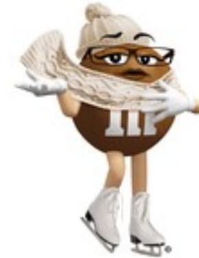
Figure Skating -For all Ages